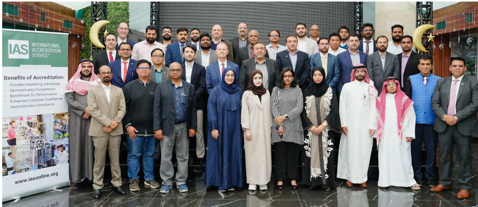
Customers from the Kingdoms of Bahrain and Saudi Arabia, with the IAS representatives at the event in Bahrain.