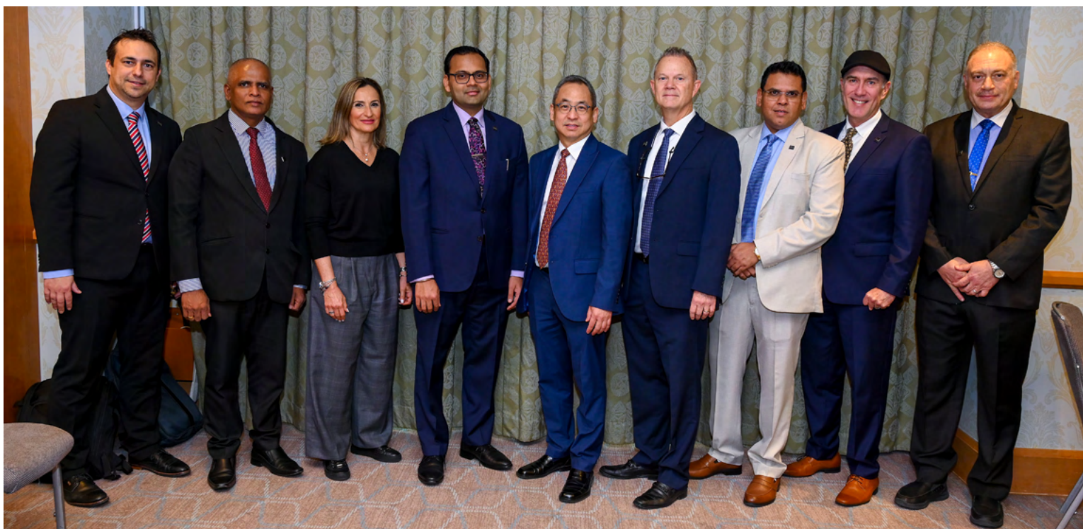
IAS team members with U.S. Embassy representatives.