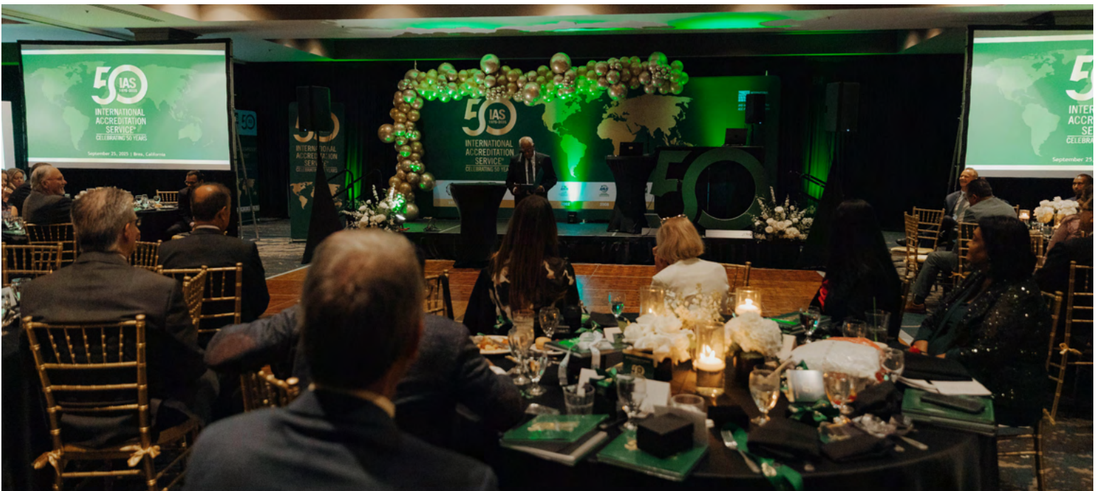
IAS 50th Anniversary Gala and Dinner at the Embassy Suites Hotel, Brea.