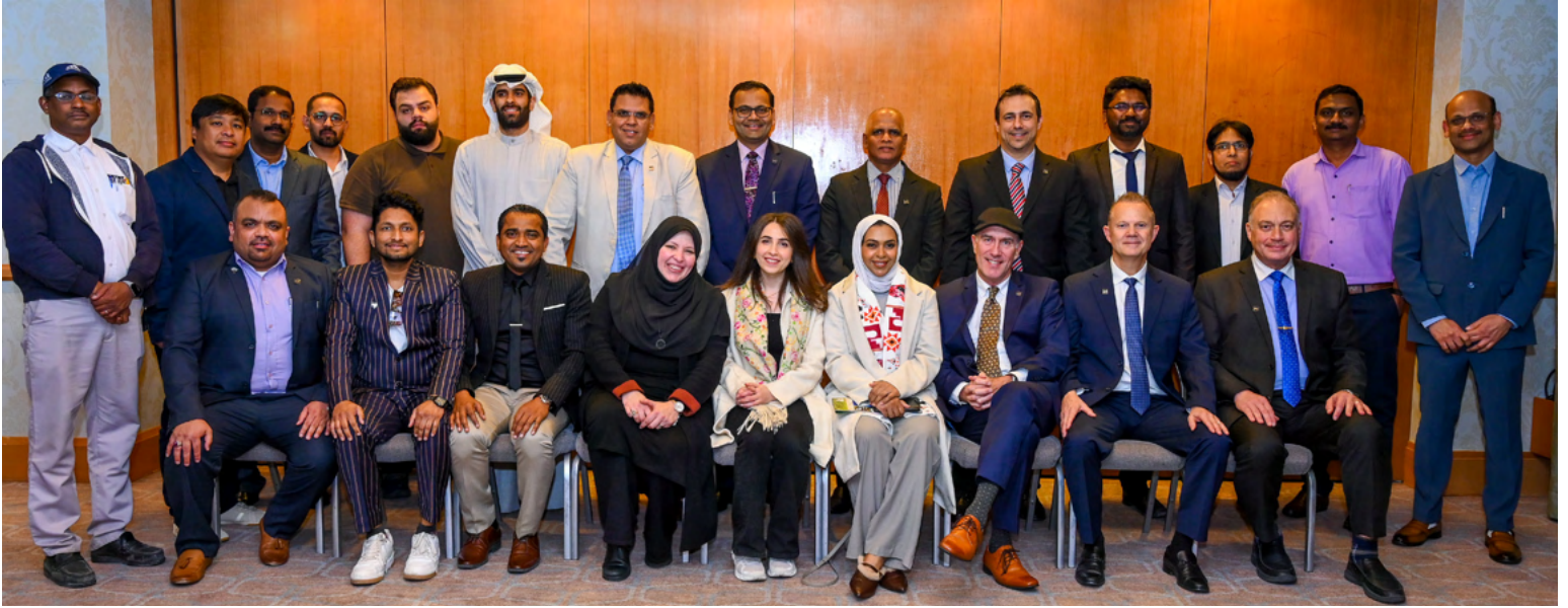
Customers from the State of Kuwait, with the IAS representatives.